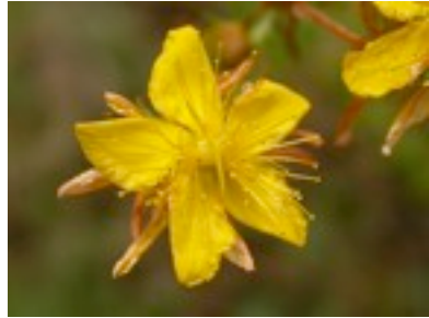
St John's wort has been shown to be effective in the treatment of depression

Plants have been used for healing since the very earliest times. Over the years their use has become more and more sophisticated. Our understanding of how they work, how they can be combined and how they can be prepared has improved radically in recent years. Herbs are especially useful for a condition that requires long term treatment, for conditions that change only slowly, or for children who live a long way off, and for whom coming to the clinic is a real difficulty. All the herbs that we use and prescribe are subjected to rigorous quality controls to ensure that they are of the best quality and free from contamination.